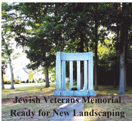
Jewish Veterans Memorial Ready for New Landscaping

The Jewish War Memorial (1962) — located in an area of high visibility at the corner of Rockdale Avenue and Hawthorn Street — was in need of some sprucing up and new landscaping.