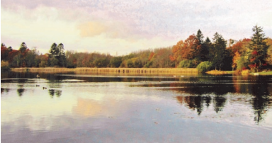
North Woods overlooking Buttonwood Pond

We continue to work with landscape architect, Ray Dunetz, on a blueprint for the development of 18 acres of nature trails in the north woods. The project, which is part of ‘ Buttonwood on the Move, ’ will have far-reaching health benefits for the entire urban community.