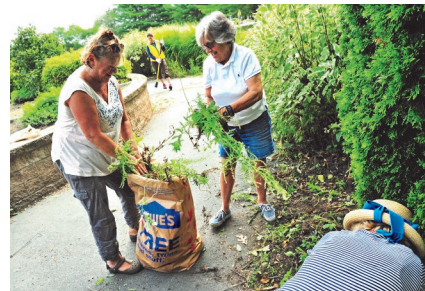
Friends and volunteers ready Sensory Garden for new plantings this fall

The Friends are asking for your help maintaining this popular spot to ensure that everyone gets to fully enjoy their day in the park.