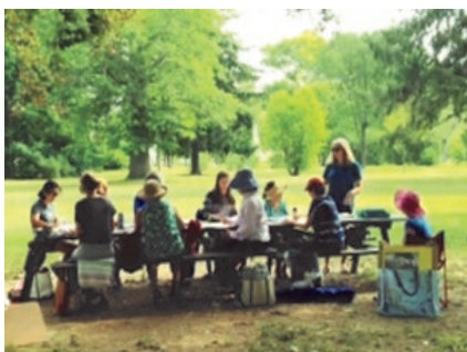
Thanks to your generosity, local artists enjoy free art classes in the Arboretum