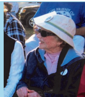
At ceremony for basketball courts 2014

A Memorial Fund has been established in her honor to support the work she loved.